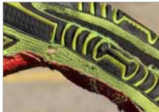
Rig Lizard® 2021 with worn through back-of-finger

When holes have abraded through the gloves back-of-hand material or forchette, protection is sacrificed, and the hand becomes vulnerable to dirt and debris getting inside the glove.