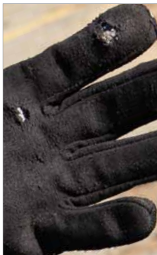
Synthetic leather palm with SuperFabric®

When the outer palm material (synthetic leather, TP-X®, etc) begins abrading and exposing the SuperFabric® interior layers, the protective qualities are greatly sacrificed. The glove can still be used, but continued use will wear down the guardplates, putting hands at risk for an injury.