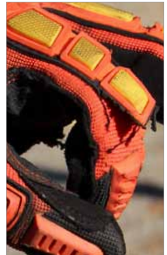
GGT5® 4021X with detached impact guard

Back-of-hand impact guards should not be pulling away or hanging off the glove. Impact guards that have become detached do not provide accurate protection, and can act as a catch hazard.