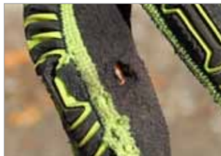
Rig Lizard® 2021 with worn through forchette